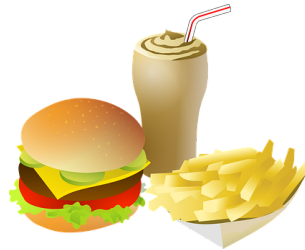
5. Fast Food