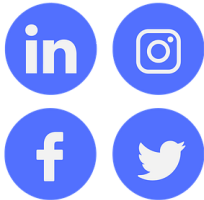
1. Social Media

Task: Discuss what people used to do before each of the items pictured were invented.