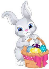
1. Easter Bunny.

Task 1: Can you name the Easter-related things shown in the pictures? Open to students ideas as they could go into more detail into the representation etc. of each image.