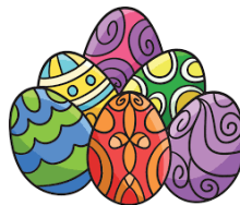
5. Easter eggs.